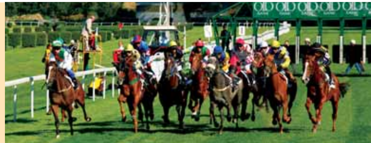
Bratislava – Petržalka

At the foothills and in the mountains of the High and Low Tatras, Lesser or Greater Fatras, the Carpathians or Javorníky mountains, and in the valleys of the Slovenské rudohorie mountains, you can find a rich tradition of horse breeding. Horses – the graceful animals – in the past served humans by working in the fields or in the woods, and today bring light to the Slovak countryside with new trends of use. Horses enrich some enjoyable activities on the ranches: be it riding in a carriage; going through the snow-covered countryside in a sled; admiring the country from a cross-country carriage; or the modern dynamic combination of skiing and the horse's quick trot - skjöring.