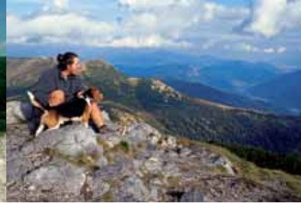
The Low Tatras

Would you like to get acquainted with one of the world's most compact yet beautiful mountains ranges? Would you care for a walk in the clouds while savouring the panoramic views of the peaks and valleys? How about spending hours closer to the sun and the stars?