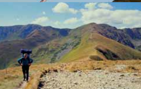
The Low Tatras