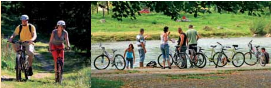
Pieniny National Park

You can ride your bicycle to see the castles, towns and picturesque villages, or choose more demanding mountain cycle routes. You have a choice of 26 cycle super-routes which are longer routes leading through the river valleys and connecting several regions. Among the most impressive regions for road cyclists are the Danube and Váh river regions, Záhorie region, the Prievidza surroundings, Spiš region and Slovak Karst region. Mountain cycling enthusiasts can set off on their bikes to the hills of the Lesser Carpathians or the High Tatras, or choose to explore the natural beauty in the surroundings of Poľana, Poloniny and the Vihorlat hills. Many of the cycle routes are thematic, e.g. the Icon Route connects the wooden churches of eastern Slovakia or the Slovak Karst cycle super-route which takes the visitor through the beautiful and interesting points of this magnificent national park. Many of the cycle routes join each other and are interconnected with international cycling routes which connect Slovakia with the neighbouring countries.