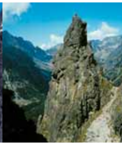
The High Tatras