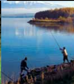
Liptovská Mara reservoir