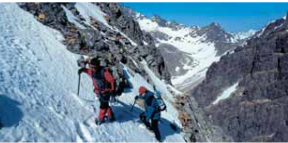
The High Tatras

The Veľký Rozsutec peak (1,609.7m, 5,281.17ft), situated in the northern part of the main crest of the Krivánska Malá Fatra mountain range, is considered by many to be the loveliest peak in Slovakia. Its height and form dominates the whole surrounding; its typical dolomite relief is made up of multifarious rock formations, at the foot of which scree cones form. The peak is the centre of the national nature reserve of Rozsutec, which is one of the most precious botanical habitats, preserving biocoenoses and endemics, and has a large presence of protected and endangered plants and animal species.