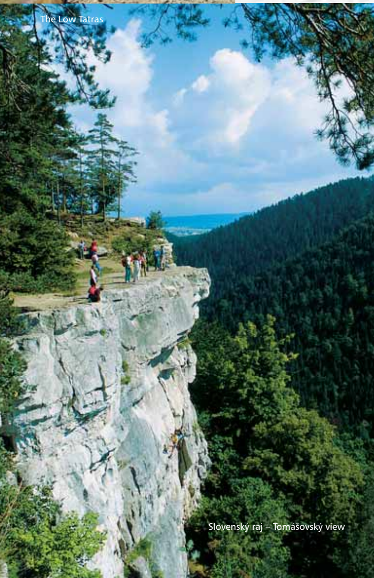
Slovenský raj – Tomášovský view

Gerlachovský Peak with its 2655m height is the highest point in the Tatras, as well as in the whole of Slovakia and indeed, the Carpathians. Its height, accessibility and beauty make it one of the most visited peaks. The ascent to Gerlachovský Peak is only allowed with a mountain guide. In case of emergency, the Mountain rescue service is on hand, being the organizer and executor of rescue services in the mountainous areas.